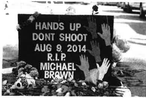
A memorial for Michael Brown

Subsequent protests and peaceful demonstrations were organized by Black Lives Matter members throughout 2014. They continued through the next several years. Some were organized by the movement itself, while others were created by other organizations but supported by Black Lives Matter members.