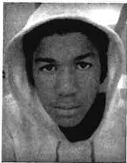
A photo of Trayvon Martin wearing a hoodie as he was wearing on the night of the shooting

In 2012, the murder trial of George Zimmerman took place in Florida. Zimmerman was charged with murdering an unarmed 17-year-old black teenager named Trayvon Martin. Zimmerman shot Trayvon Martin with a handgun in a gated community, where Zimmerman was the neighborhood watch coordinator. Zimmerman accused Martin prompting his own death through seemingly threatening actions. The jury ruled that Zimmerman was defending himself, even though the young man carried no weapon.