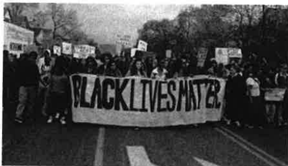
Black Lives Matter protest on a college campus

The Black Lives Matter movement is relatively unstructured and is decentralized. While there are several prominent leaders within the movement, it focuses primarily on the actions of local groups. Through an online network, the larger movement shares its core values and guidelines. Local groups are asked to agree to these guidelines when identifying with Black Lives Matter. However, they are called upon to use their own structures and to develop their own actions to create regional impact.