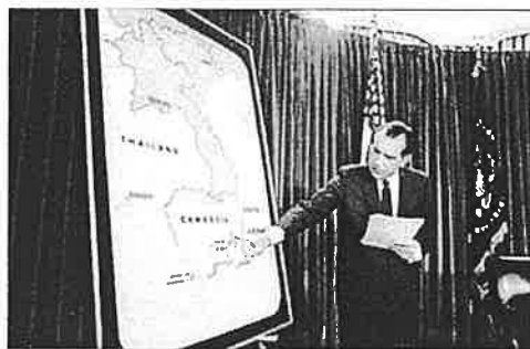
President Nixon announcing the U.S bombing of Cambodia

be drafted. People began recognizing that Nixon was very committed to waging war, which caused an uptick in anti-war protests.