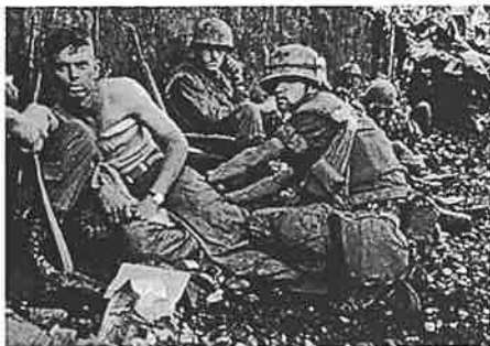
American soldiers serving in the Vietnam War

The U.S. began supporting the South Vietnamese in a civil war against a Communist North Vietnam in the 1950s. This U.S. involvement was not universally supported by Americans. Many spoke out against the fact that U.S. troops were being sent to fight in the war. By 1968, there was a high level of discontent with the American presence in the war. Presidential candidate Richard Nixon campaigned on the platform that he would end the war, which helped him win the election.