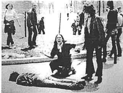
Photo taken immediately following the Kent State shootings

Soon after students arrived, soldiers of the Ohio National Guard used tear gas to force the group to disperse. Protesters had prepared for this by wearing gas masks, and many of them stayed in place. In response, guardsmen approached the protesters with rifles and bayonets drawn. Many of the students scattered, but some soldiers claimed they still felt threatened. Twenty-nine national guardsmen began firing their weapons at the protesters. The bullets struck thirteen people, killing four and injuring nine. Two of those killed were not even protesting. They were simply students walking across the campus.