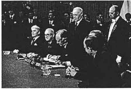
Signing of the Paris Peace Accords, 1973

Police officers joined the protests to show that they sided with the students.